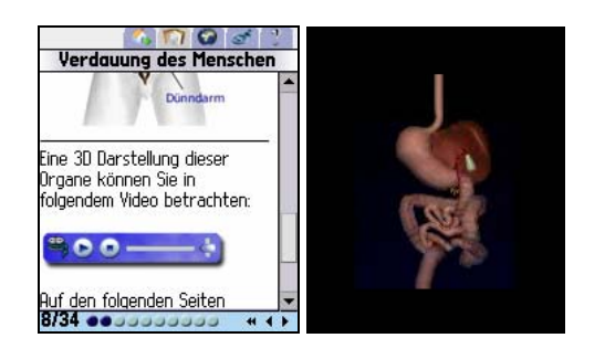
Figure 2: Example Screenshot of a MILO: Media-bar for the playback of a video

The learning objects for the MLE are written in XML (eXtensible Markup Language). XML is an open and international standard which is easy to learn. The use of XML makes it possible to present every kind of learning content. So the MLE is not restricted to those