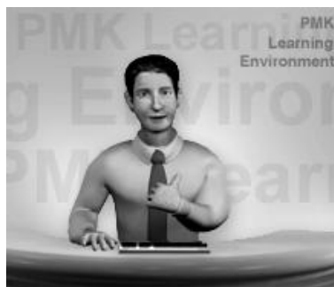
Exhibit 2 – Frame showing VICTOR's gestures when the student does an exercise correctly

At the end of this stage, the character's animations, used to represent VICTOR's emotional states (e.g. joy (Exhibit 2)) were defined. A chatterbot that answers some questions on the domain was integrated to VICTOR.